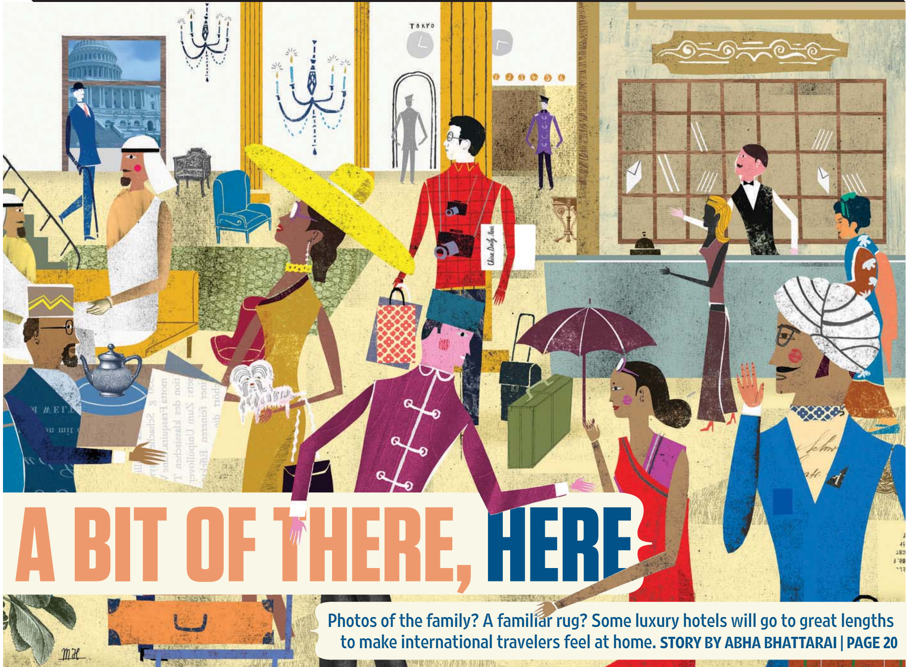
Photos of the family? A familiar rug? Some luxury hotels will go to great lengths to make international travelers feel at home. STORY BY ABHA BHATTARAI | PAGE 20

OCTOBER 22 ~ OCTOBER 28, 2012 • VOLUME 3, ISSUE 28 • $2.50